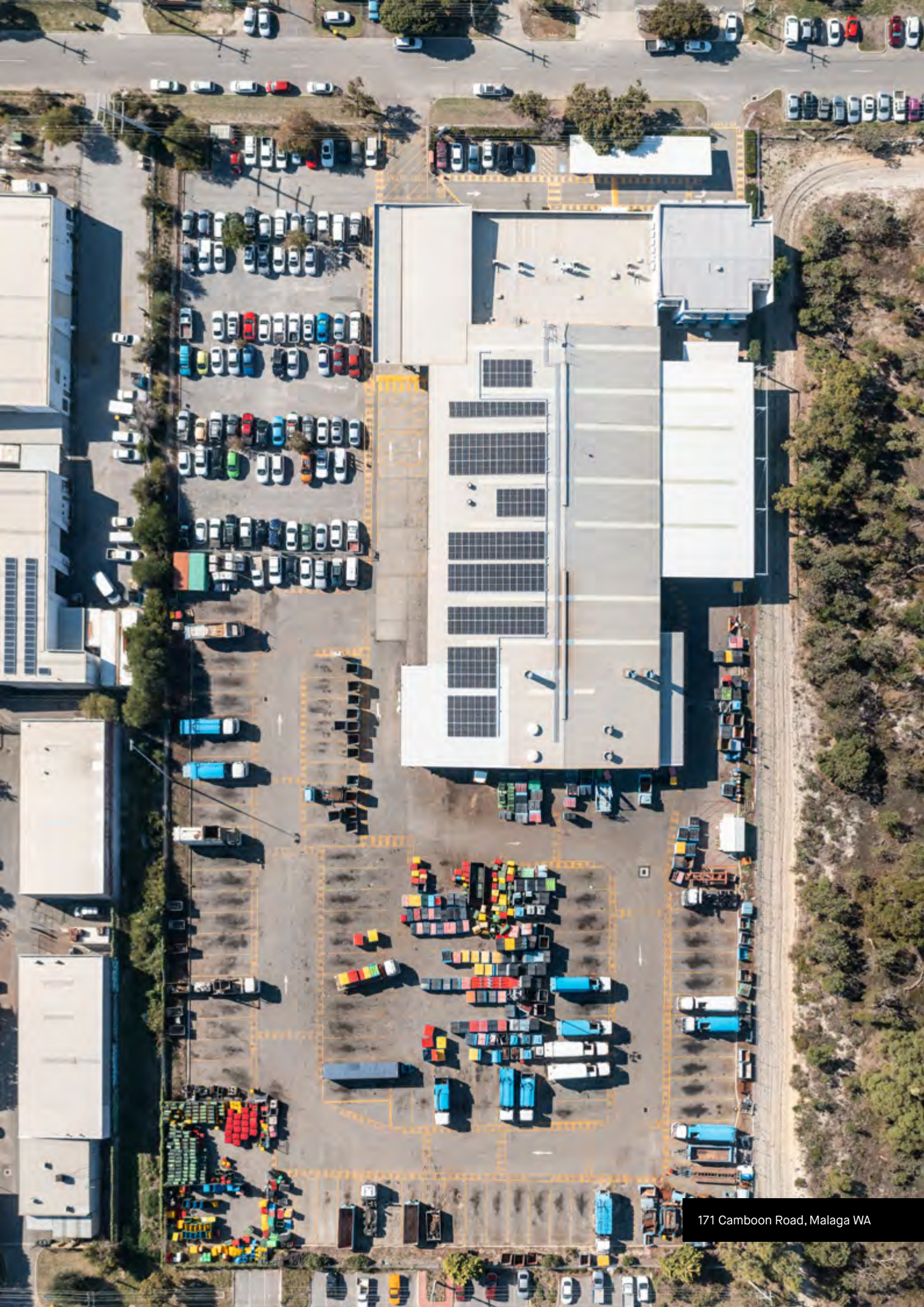
171 Camboon Road, Malaga WA