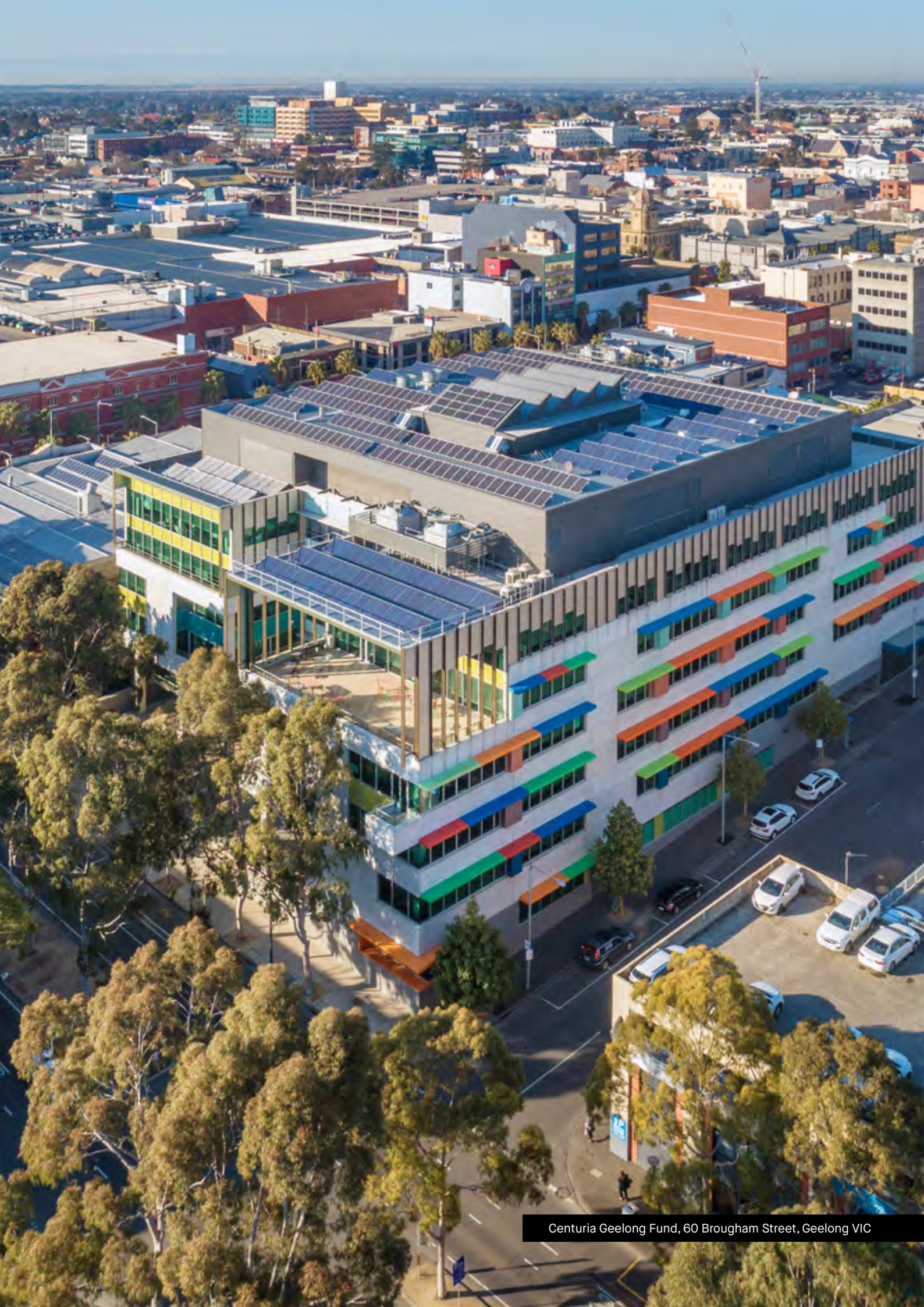
Centuria Geelong Fund, 60 Brougham Street, Geelong VIC