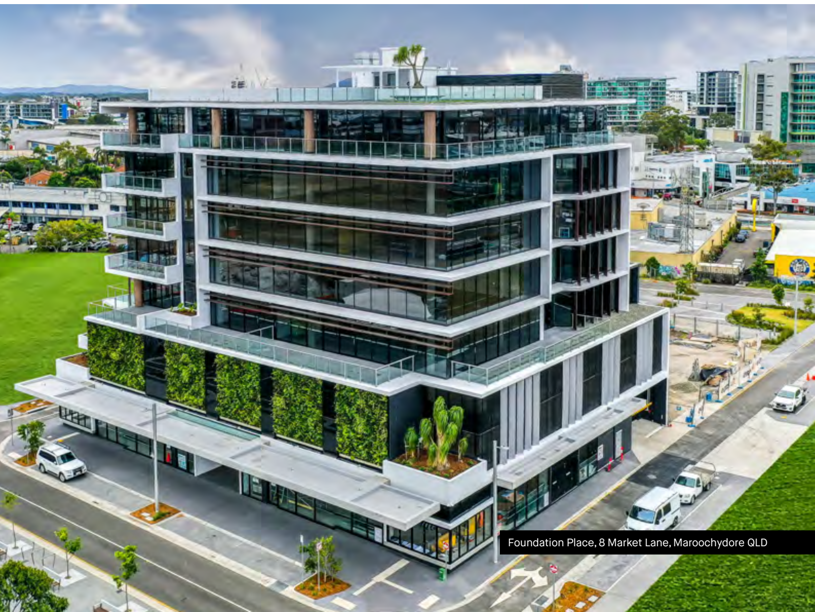
Foundation Place, 8 Market Lane, Maroochydore QLD