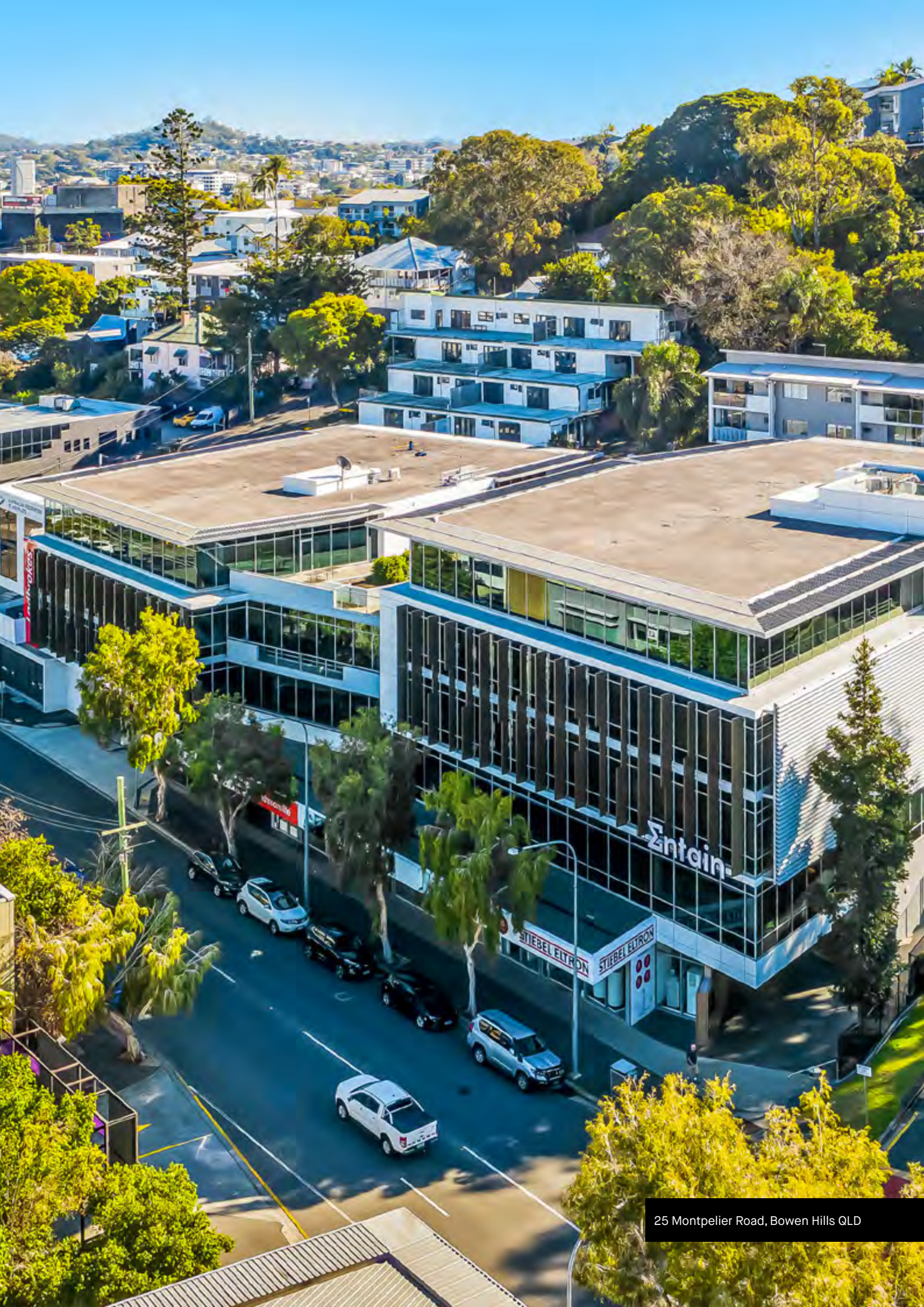
25 Montpelier Road, Bowen Hills QLD