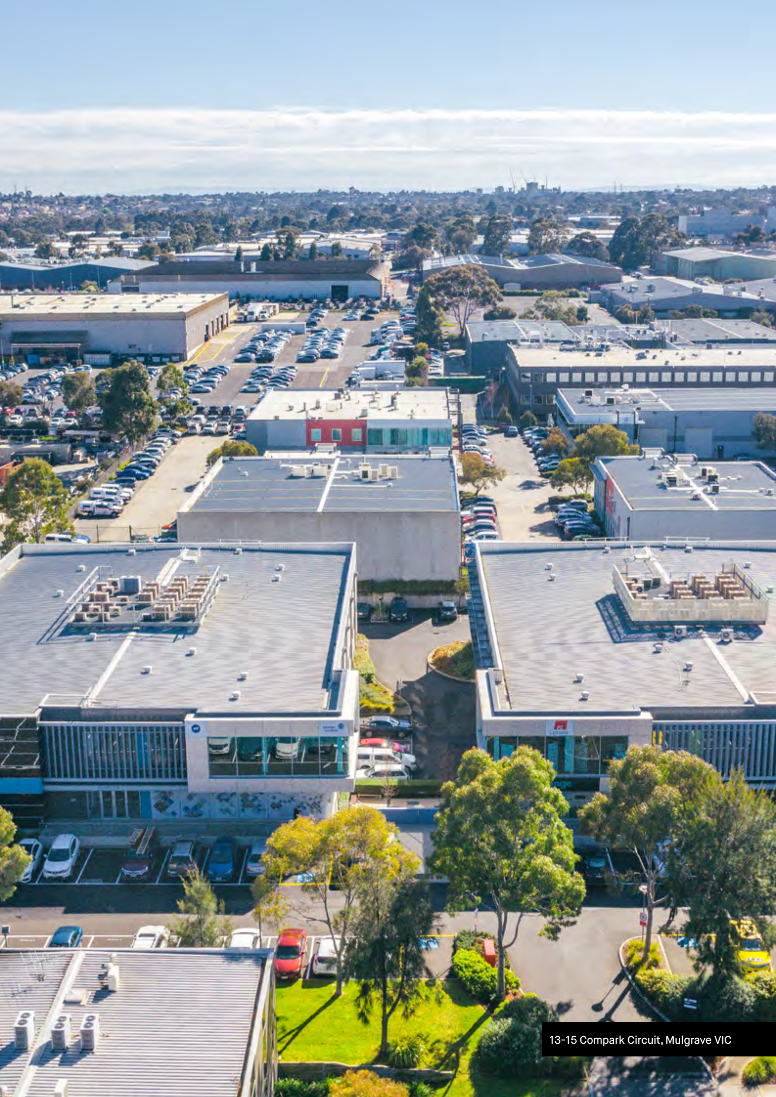
13-15 Compark Circuit, Mulgrave VIC